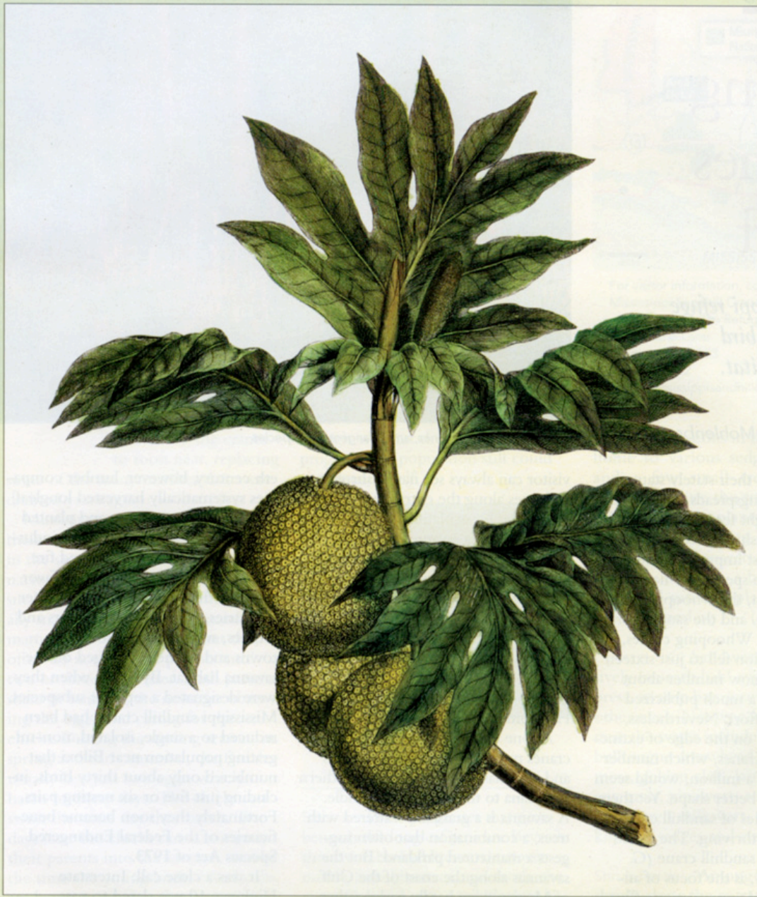
Tahitian breadfruit is shown here as it was published in the journals of Captain James Cook, during Cook's first Pacific voyage, 1768–1771.

cultivars I sampled from the Solomon Islands and farther east, in Efate, the Fiji Islands, Samoa, and the Society Islands. The evidence suggests that hybrid breadfruit cultivars, developed in Micronesia, could later have joined the breadnut-derived breadfruit in Melanesia and Polynesia.