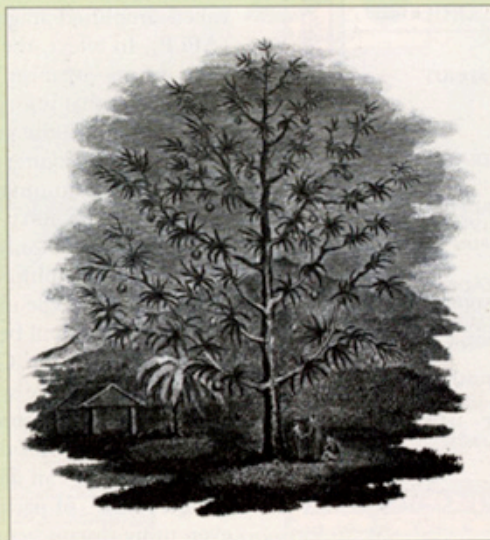
Breadfruit tree, shown here in an engraving made about 1800, grows to a height of sixty-five feet.

Finally, the route from Melanesia into Micronesia might well have been a two-way street. I discovered dugdug fingerprints in a small number of